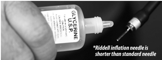
*Riddell inflation needle is shorter than standard needle